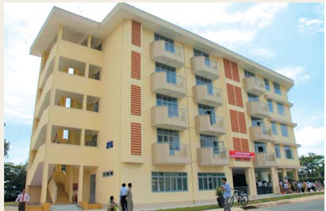
A dormitory for students of Quang Ngai Province