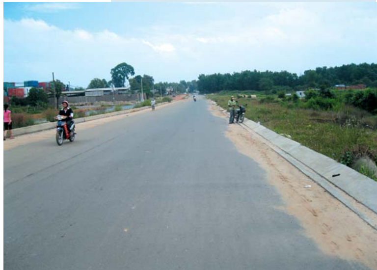
Main road No. 5