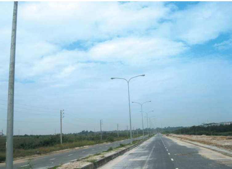
Belt road No. 3