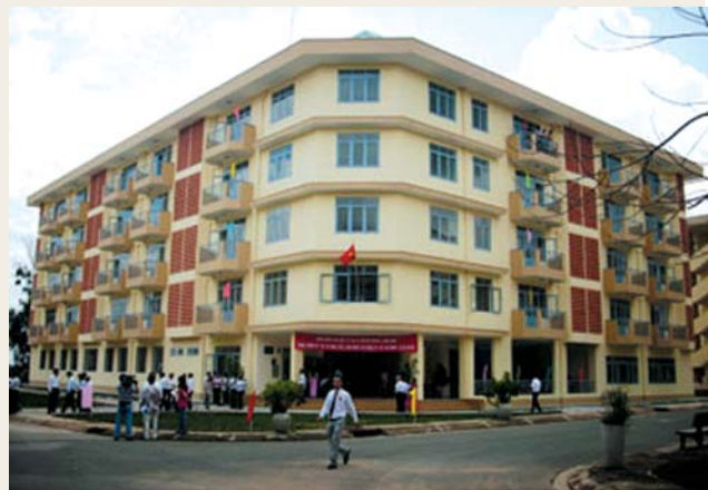
A dormitory for students of Lam Dong Province

A student of Room A5, VNU-HCM Dormitory system Chairman of Dormitory's Broadcaster Club Faculty of Literature and Language, University of Social Sciences and Humanities