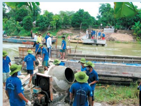
University of Technology volunteers and the bridge constructors in Doc Binh Kieu