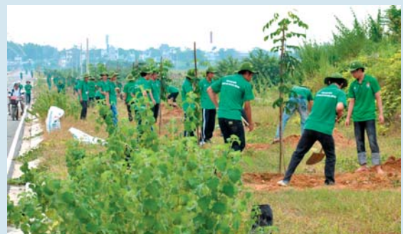
The contest rehearsal by students of University of Economics & Laws

In support of the program "For a Civilized and Modern City" launched by Ho Chi Minh City Youth Union, 315 members of VNU-HCM Youth Union participated in planting trees at VNU-HCM campuses. As a result, 500 trees were planted in Central Library, Street Number 5, and Guest House at VNU-HCM campuses.