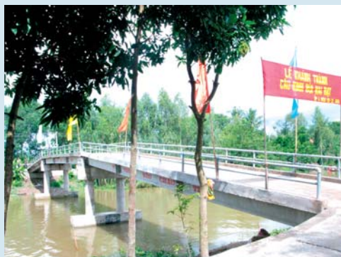
Opening ceremony of a bridge in Doc Binh Kieu, Thap Muoi, Dong Thap