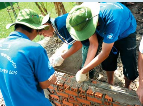
University of Technology volunteers were building a loving house in My An, Thap Muoi, Dong Thap