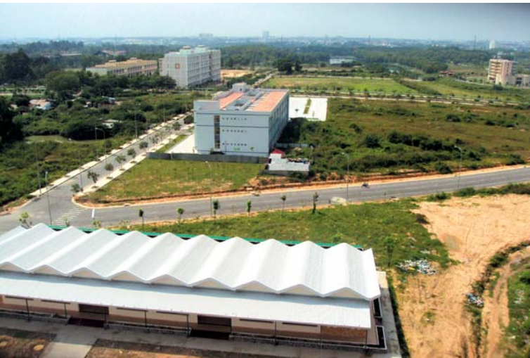
Road No. 7