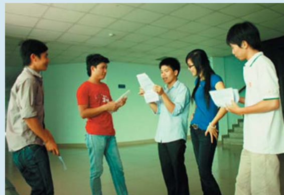
The contest rehearsal by students of University of Economics & Laws

VNU-HCM organized the program "Students as companions to laws" in order to increase its students' awareness of laws through visual and active training methods. The program attracted the participation of thousands of VNU-HCM students. Each affiliates registered to participate in propaganda contests including dramas, multiple choices, short movies, panel and slogan design, talks and legal consultation... The contents mainly focused on traffic law, criminal law, civil law, and law of sexual equality, etc.